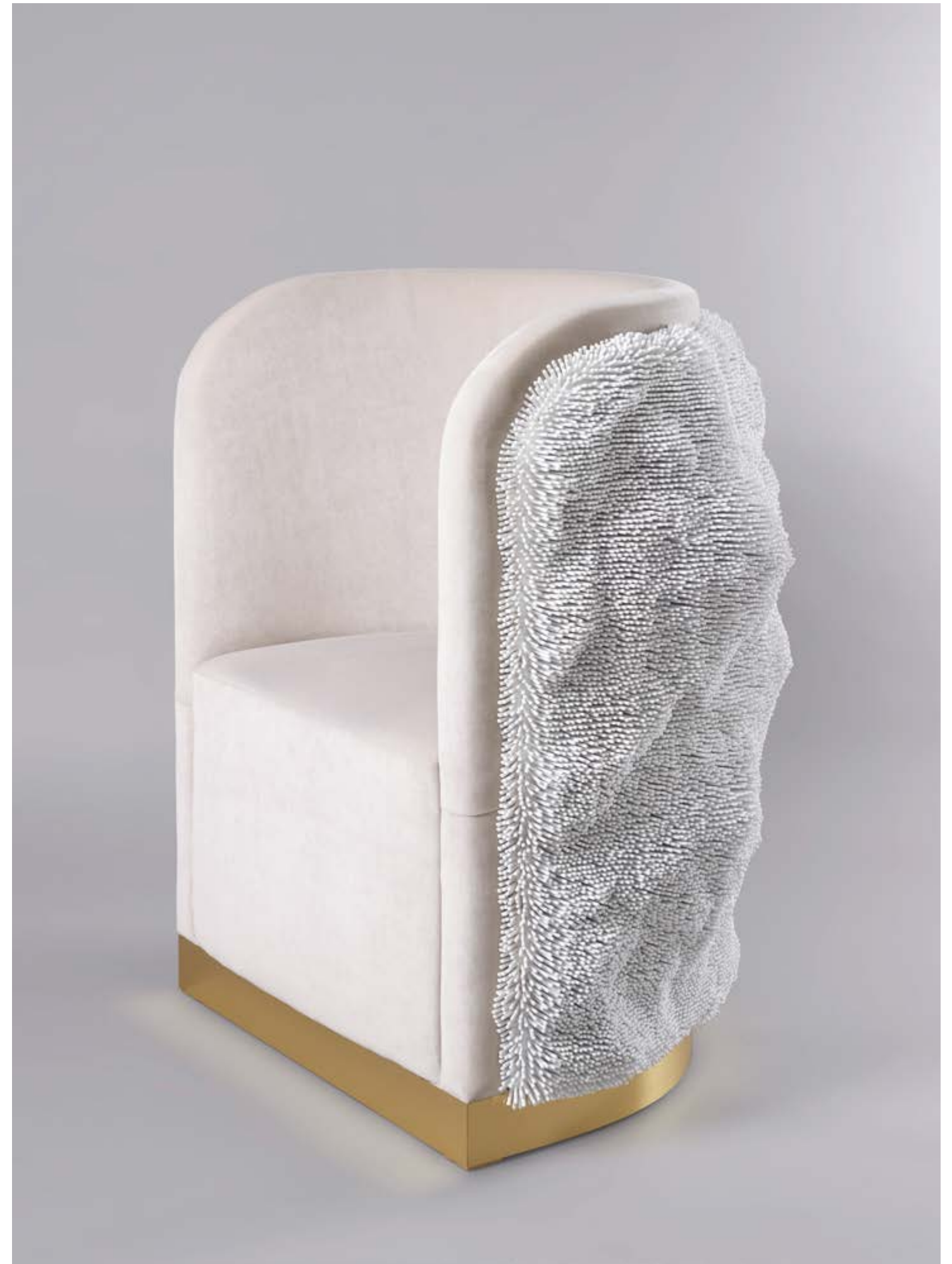
Sea Anemone, Armchair