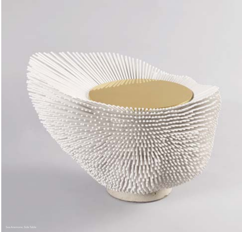
Sea Anemone, Side Table

Imagicasa was immediately drawn to her 'Sea Anemone' collection, the series with which it all began for this designer. 'Of course I remember my first work well. I spent almost one year in a garage next to my home, trying different materials, shapes over and over again and slowly the vision I had in my head became clearer. That is how my first 'Sea Anemone Family' came to life: three side tables and two sculptures,' Raeder says. As the name suggests, the designs are inspired by sea anemones and that is clearly visible in the many rods that make up the designs. They are reminiscent of the tentacles of the sea creature. Raeder eventually designed chairs, side tables, coffee tables, mirrors and lighting in this style. They are all true works of art and look more like sculptures than furniture. Only when you take a closer look you can see that the pieces are both functional and decorative. Each piece in this series was made by hand and the thousands of white beech wooden rods were all individually shaped, lacquered and assembled. At first glance the